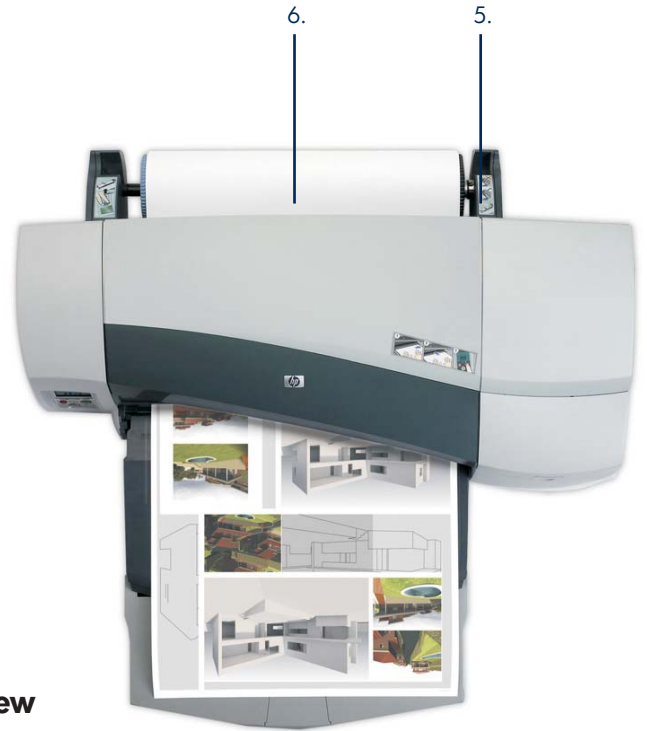
HP Designjet 70 Printer top view