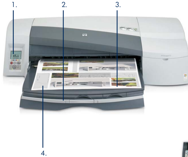
HP Designjet 70 Printer front view

6. Optional roll feed feeds rolls up to 18 in wide and 150 ft long.